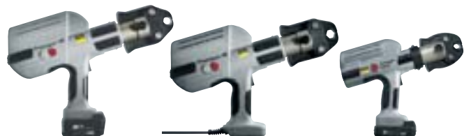
The press tools from Viega: Pressgun 4B, 4E and Picco

The core of the system is the world-recognised Viega press technology with SC-Contur. It guarantees security and flexibility. This is because the Viega press connector range includes versatile installation and connection designs, even in large dimensions. It offers an extraordinary scope of practical solutions with a huge versatility of different press connectors: bends, angles, crossover bends, T-pieces, threaded adaptors, sleeves, screws and fittings with press connections are available.