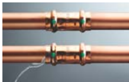
Above: sealed by pressing. Below: visibly unpressed.

With good cause, more and more specialist fitters are turning to innovative Viegapress technology. As well as a maximum level of safety, it also saves a great deal of time.