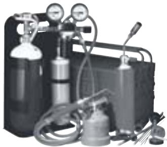
In former times

No oxygen or gas cylinder, no burner, no soldering accessories – instead, just one of the three comfortable Viega Pressguns. Viega press technology works with a unique press tool.