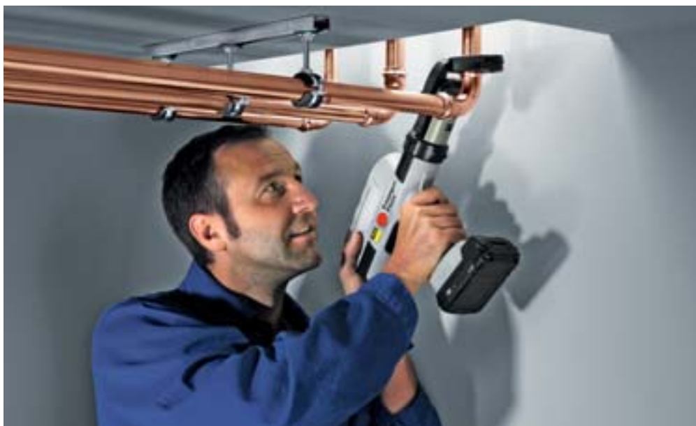
Working without a trace: With the Viega press tools, you can work effortlessly in the most hard-to-reach places without leaving a trace.